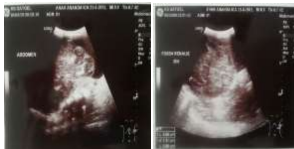
FIGURE 2: Abdominal Ultrasonography

With the help of a radiologist, an abdominal ultrasound examination was performed on this patient (Figure 2), which revealed a left middle abdomen solid tumor measuring 20 x 15 cm was considered to be malignant, with ascites and potential infiltration of the pancreas and spleen. The suspected origin of this tumor is from the left kidney (suspected Wilms Tumor). The liver, right kidney, and bladder all appeared to be in good condition.