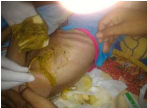
FIGURE 6: Clinical picture of the patient when there is anastomotic leakage, it shows spillage in the form of feces coming out of the drain tube of Douglas Cavity.

The patient developed abdominal cavity abnormalities five days following the second surgery, including widespread peritonitis due to anastomotic leakage from the ileum (Figure 6). A third operation was performed on the patient to manage the infection's source. During the investigation, faecal material was discovered along with murky peritoneal fluid. Anatomical leakage was also discovered at 20, 50, and 70 cm from the Treitz ligament. After basic repair, the patient's abdominal cavity was cleansed and a bogota bag was implanted. According to the peritoneal fluid culture in the third operation, the patient's antibiotic was switched to Meropenem.