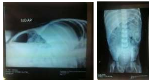
FIGURE 5: Plain radiograph of the abdomen in 2 positions indicates free air in the abdominal cavity

The patient was given antibiotics Cefotaxime + Sulbactam and Metronidazole after surgery to address infections in the urinary system (leukocytes 21,370, accompanied by hematuria). This patient had infection problems while receiving surgical care. A positive ESBL blood culture was found in this patient. Two weeks following the first procedure, monitoring in the patient's room revealed evidence of hollow organ perforation (Figure 5). During the postoperative treatment of radical nephrectomy, this patient also had electrolyte imbalance. To aid healing, this patient was given electrolyte and albumin preparations.